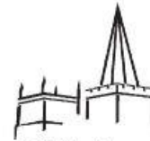
St Mary's Church Purton

Ps: The winners of the 1974 Quiz at the party were a group of friends called The Dream Team! 2 nd came a Purton group of friends called Intelligent Guessers!! Hooray!